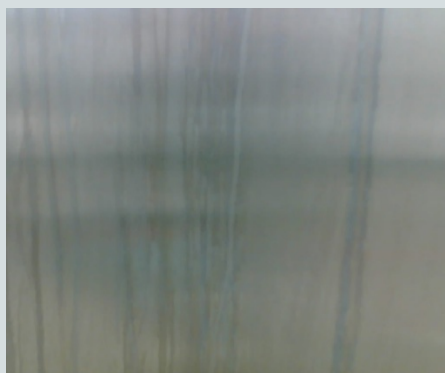
Stainless Steel Sheet Fabrication Prior to Application