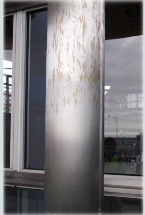
This column showed signs of corrosion shortly after installation. The lower area has been treated with Cleaner 61.

Carried out by spray with either the trigger spray supplied or a pump action spray device, the product is applied liberally directly to surface fascia's, ensuring that all areas are fully covered and wetted. In severely soiled conditions or when application is carried out on used or old fabrications, abrasion with a ScotchBrite pad or similar is advised, although care must be taken not to damage the existing surface finish. Always abrade in the same direction or a direction which compliments the component or fabrication.