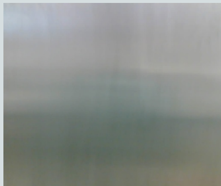
Stainless Steel Sheet Fabrication After Application